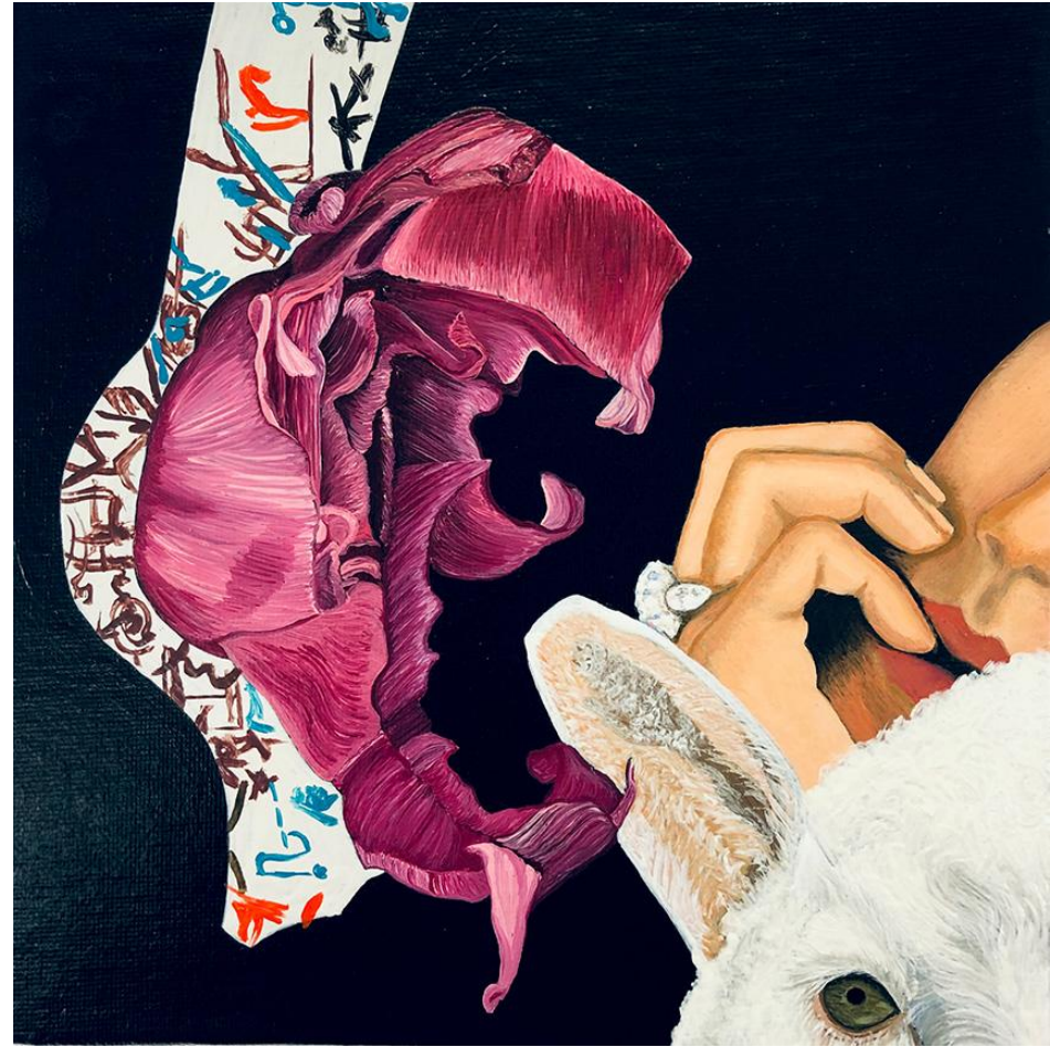
Contemplation ( sold )