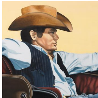
Resters 2006 - 2012