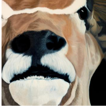
Memory Installation 2015