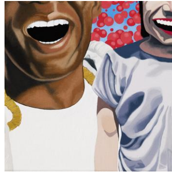
Duos 2012 - 2013