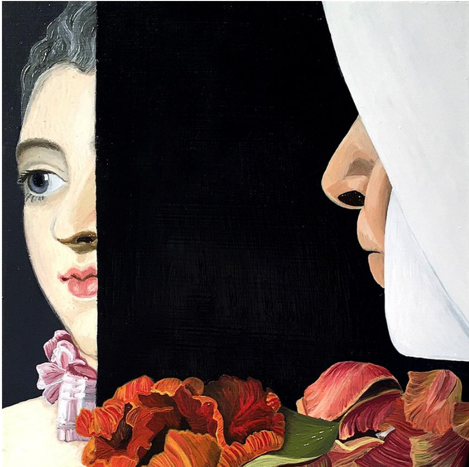
Baroque ( sold )