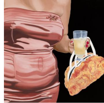
Torsos 2011 - 2014