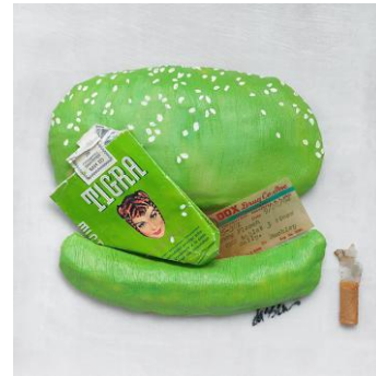
Hamburger Art 1998 - 2005