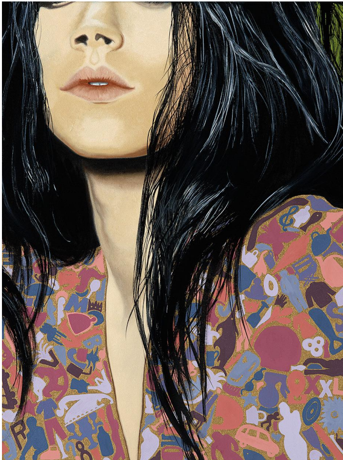
BOETTI (sold) 2013, Series: Torsos Oil on canvas, 24 x 18.1 inches