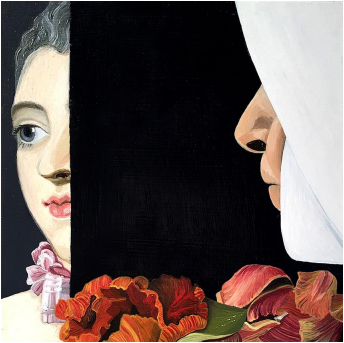
Miniatures 2017 - 2023