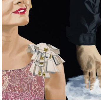
Human:Nature 2013 - 2014