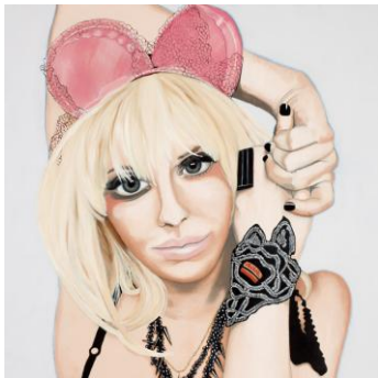
Lookers 2006 - 2024