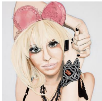
Lookers 2006 - 2024