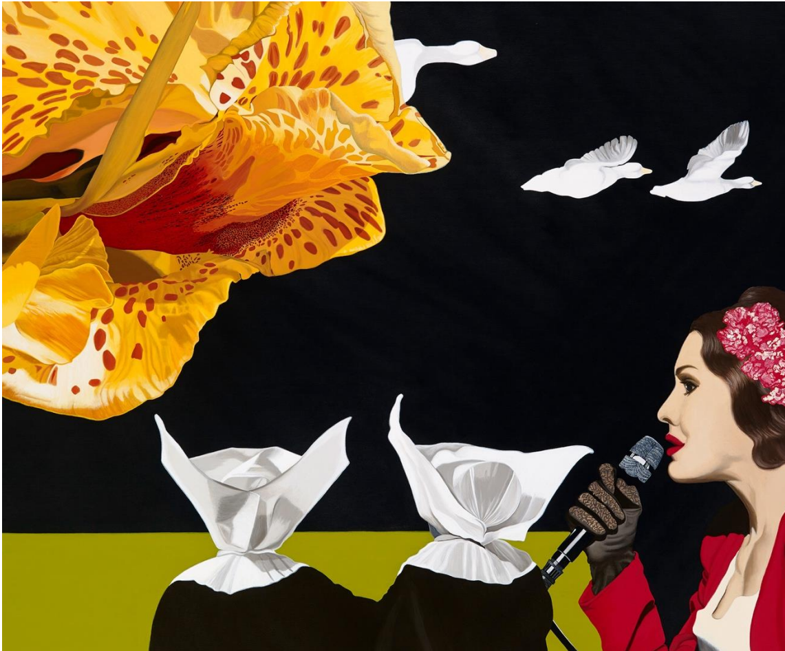
SPIRIT ( sold )