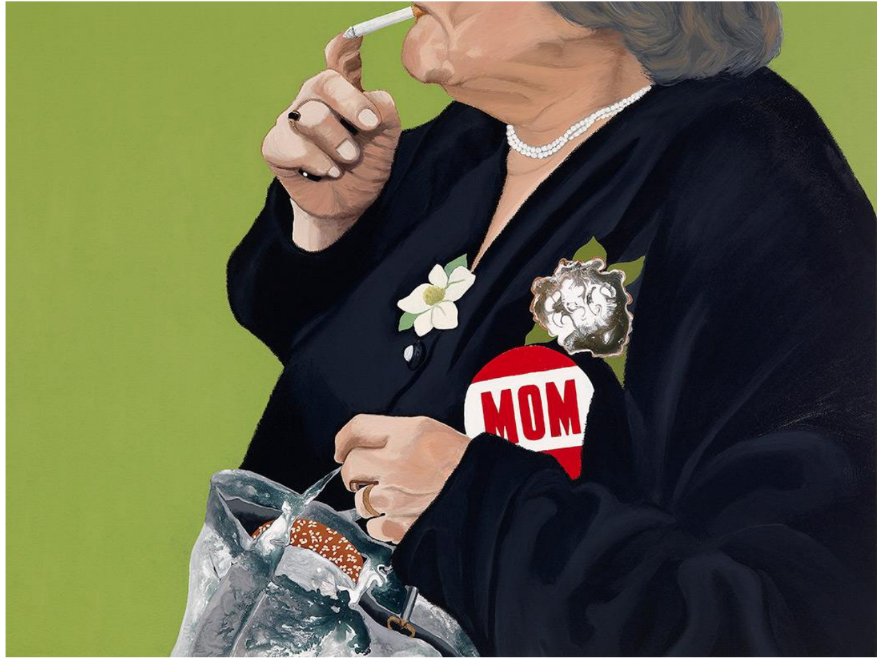
MOM ( sold ) 2011, Series: Torsos Oil on canvas, 18.1 x 24 inches