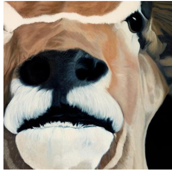
Memory Installation 2015