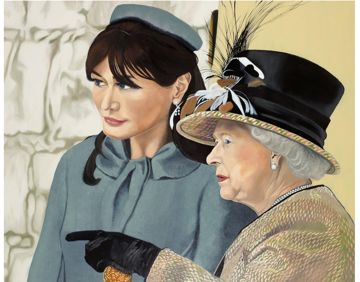
THE ROYAL BURGER (sold) 2009, Series: Lookers Oil on canvas, 63 X 78.7 inches