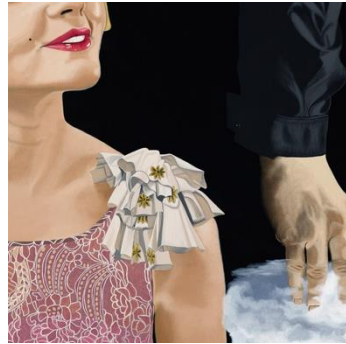
Human:Nature 2013 - 2014