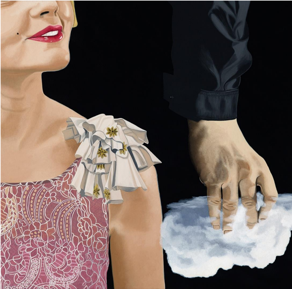
ZELDA 2014, Series: Torsos Oil on canvas, 23.6 X 23.6 inches