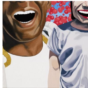
Duos 2012 - 2013