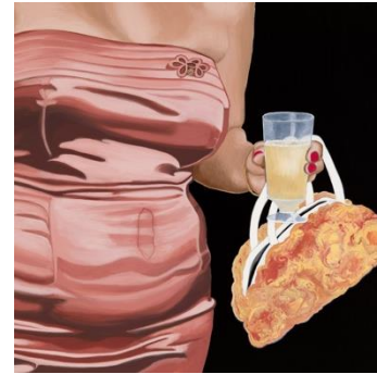
Torsos 2011 - 2014