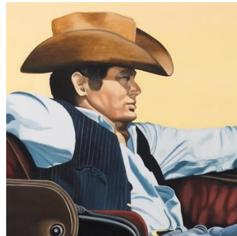
Resters 2006 - 2012