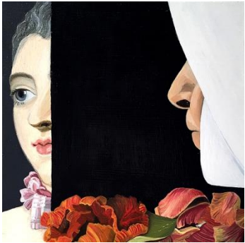
Miniatures 2017 - ongoing