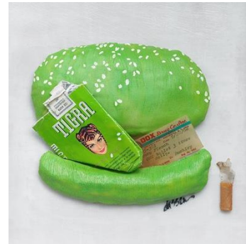
Hamburger Art 1998 - 2005